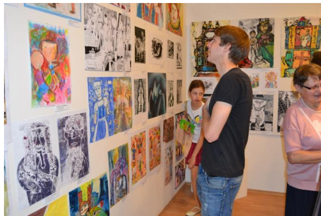
Touring the exhibition