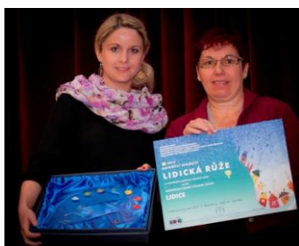
Prize of the Panel of Judges CZ - PAS Háj ve Slezsku