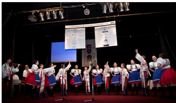
Performance by CHFG Kordulka – the dance “verbuňk”