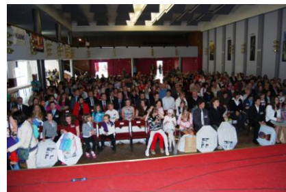
The Hall of the community centre in Kladno was full of guests