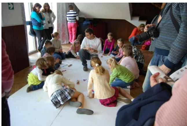
Plays with modelling clay under the guidance of a Venezuelan artist

Our special thanks go to the Committee of the Czechoslovakian Community Festival in Phillips, Wisconsin, U.S.A. for their large financial contribution to the prizes for the child-winners. Just as a matter of interest, it is the City of Phillips, Wisconsin, where there is one of the two US memorials of the Lidice tragedy (the other is in Illinois, near Crest Hill), built from donations by the Committee of the Czechoslovakian Community Festival in Phillips in summer 1943.