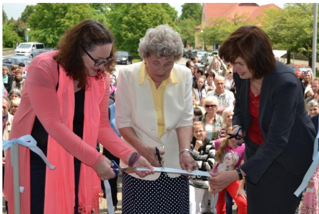
Cutting the ribbon