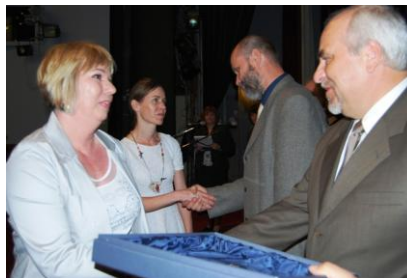
Prize of the Panel of Judges foreign school - PAS Holič, Slovakia