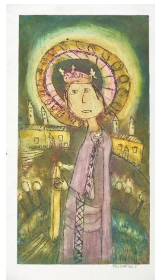
Rozálie Kabátová, 7 years, Art workshop at Galerie Paletka, Plzeň, Czech Republic

While the number of participants was lower than in previous years, the number of entries was still overwhelming. The Lidice Gallery was literally flooded and lighted up with entries featuring light – with suns, stars, lit-up cities and streets, cathedrals, tunnels, auroras, fires, fireworks and volcanoes as well as secrets of optics. Bulbs, lamps, candlesticks, candles and rays of light emanating from them could be counted in thousands. In 2 rounds and 6 days, the international panel of judges assessed not only paintings, drawings and prints, but also a lot of photos and spatial entries – of ceramic, paper, plastic and glass.