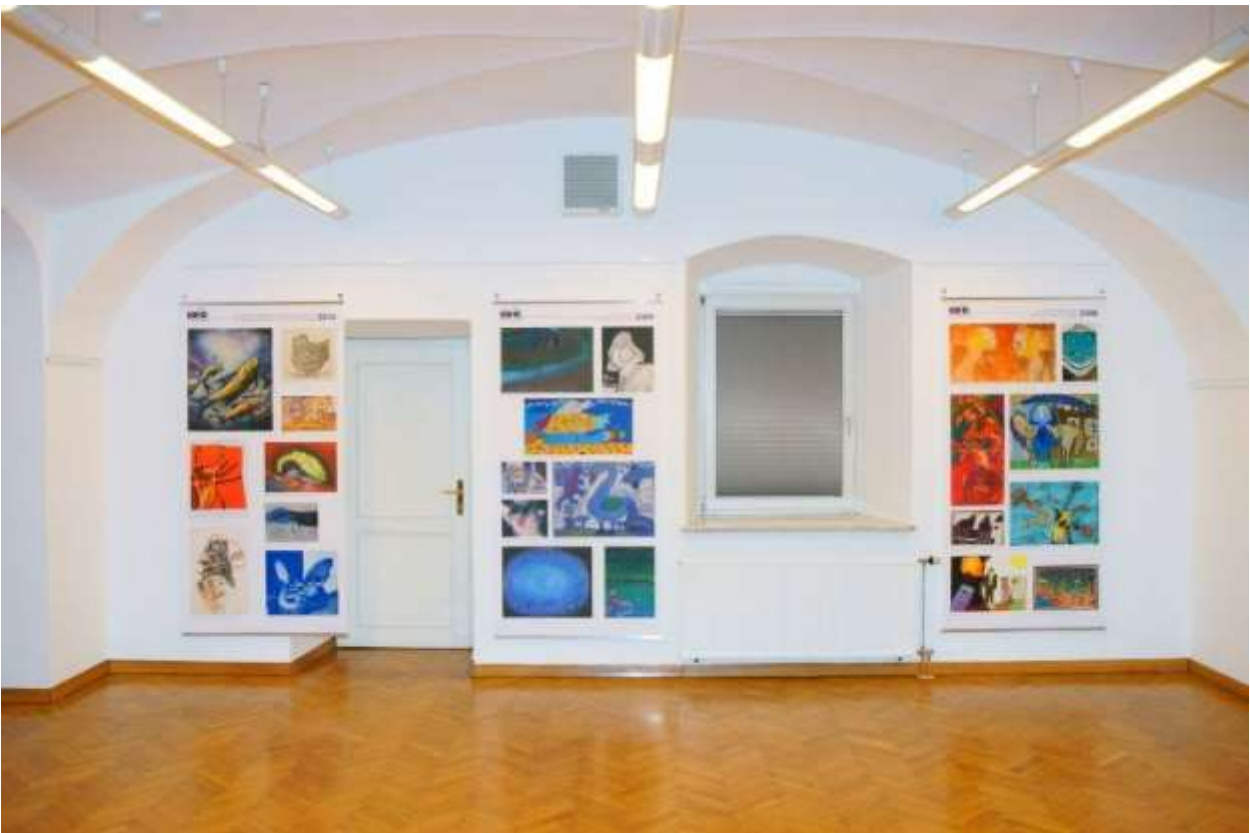
Družina Gallery, Ljubljana, Slovenia, December 2012