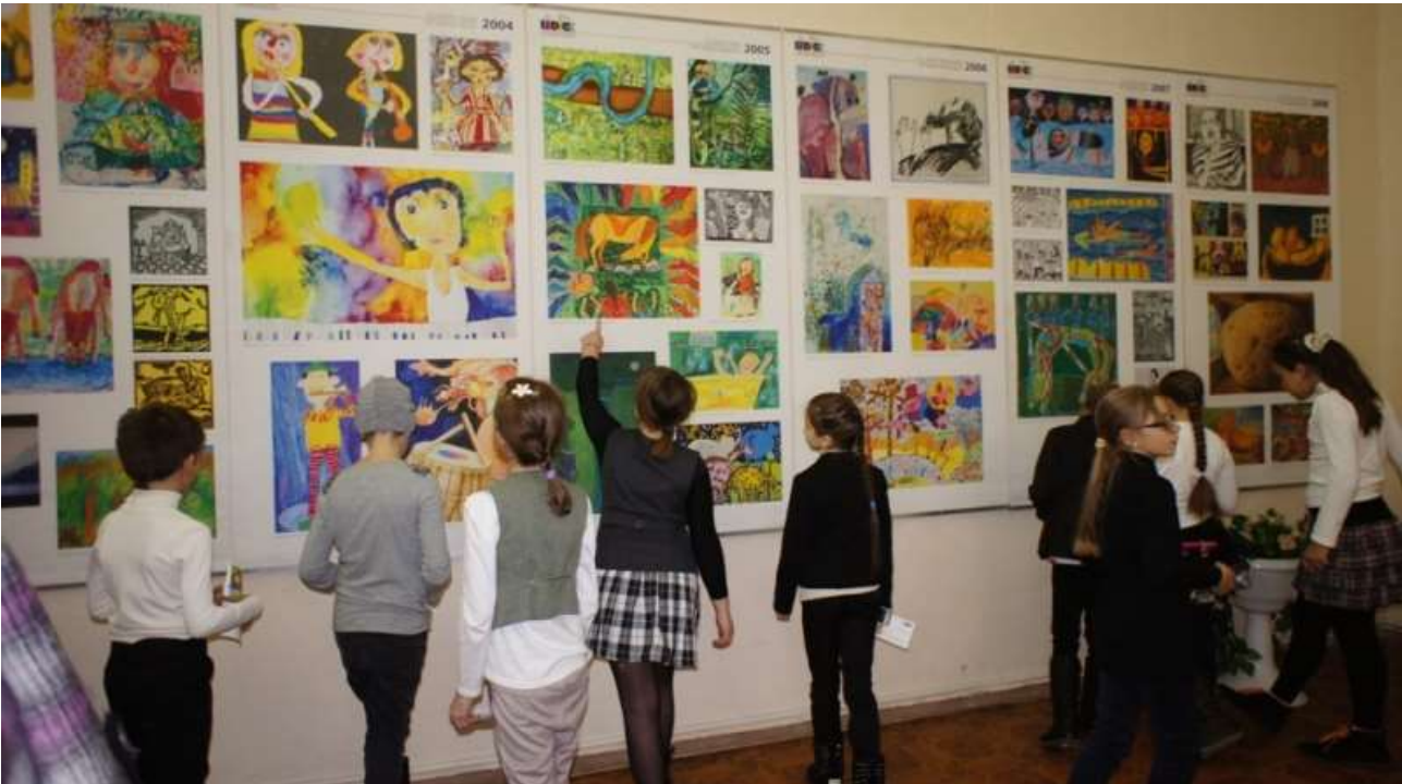
Art Museum of Kharkiv, Ukraine, November 2014