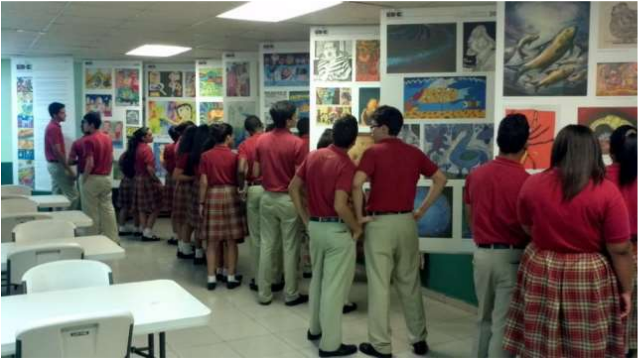
Instituto Bern, Panama, Panama City, August 2013