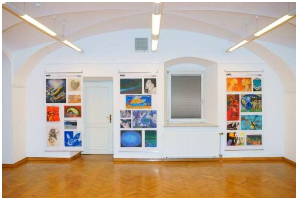
Družina Gallery, Ljubljana, Slovenia, December 2012