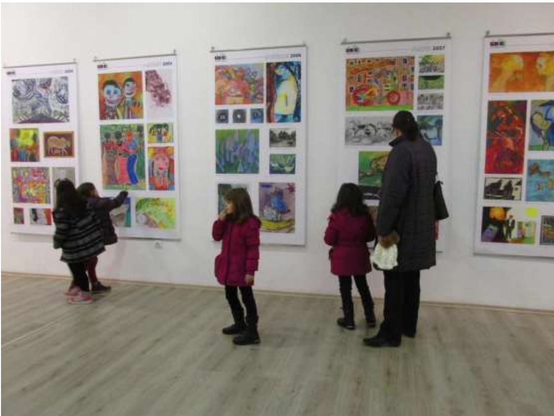
Art Center, Pleven, Bulgaria, November 2015